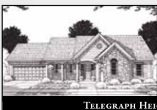
TELEGRAPH HEIGHTS SHOWHOMES BY SPEC

A GLIMPSE INTO THE HISTORY OF BATTLEFORD WEST October 9, 1912 Dear Sir, Your property "Battleford West is beautifully located on the banks of the Battle River and in close proximity to the town, being only a fifteen minute walk from the Post Office, Court House and Land Titles Office, which is the centre of town. I have no hesitation in recommending this as a high-class business and residential property, and at the prices quoted in your price list, investors should make good profits in a very short time. Yours truly, A. Champagne, M. P.