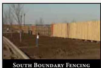
SOUTH BOUNDARY FENCING