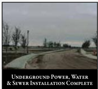
UNDERGROUND POWER, WATER & SEWER INSTALLATION COMPLETE