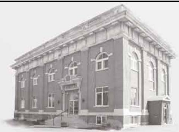
Town Hall / Opera House in Battleford Saskatchewan. Built in 1912.

BATTLEFORD WEST is located 1km south of the Yellowhead Highway at the two primary accesses into the Town of Battleford. The residential lots offer spectacular south and west facing vistas of the Battle River Valley.