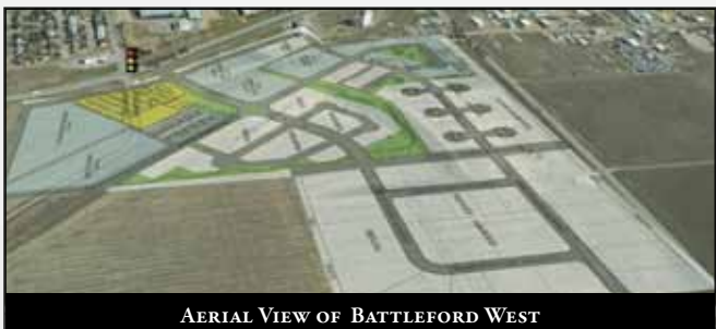
AERIAL VIEW OF BATTLEFORD WEST

ORIGINALLY PROPOSED IN 1911 THE NEW BATTLEFORD WEST IS A HERITAGE THEMED 130 ACRE PLANNED COMMUNITY COMBINING OPEN SPACES, DESIGN CONTROLLED RESIDENCES AND CONVENIENT NEIGHBOURHOOD SHOPPING.