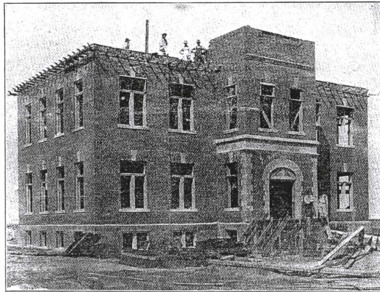
NEW HIGH SCHOOL—Under Construction

FEW towns in America are so ideally situated from a hygienic standpoint, and certainly none between the Great Lakes and the Rocky Mountains can compare with Battleford in point of beauty. This is a very important factor in making Battleford a future educational centre.