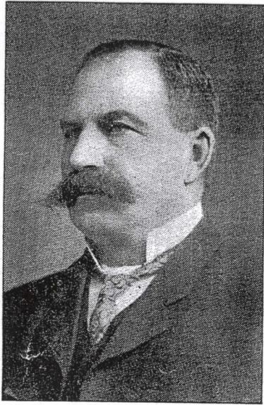
SENATOR B. PRINCE