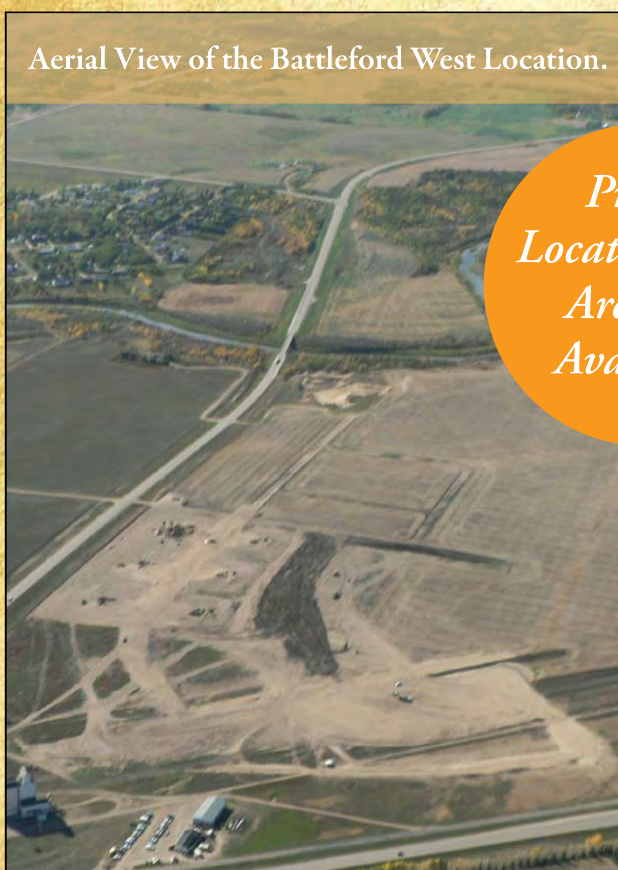
Aerial View of the Battleford West Location.

Originally proposed in 1911 the new BATTLEFORD WEST is a heritage themed 130 acre Planned Community combining open spaces, design controlled residences and convenient neighbourhood shopping.